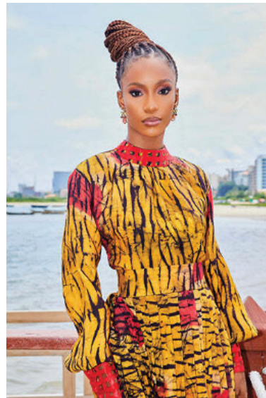
Irawo Studio designs from the 2022 spring-summer collection.